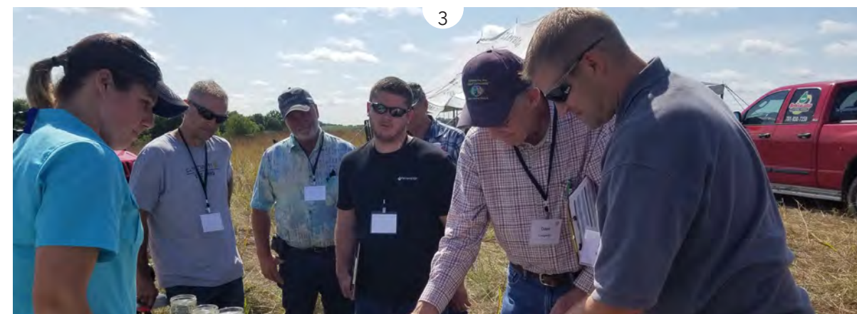
MSHC instructing Minnesota farmers on how to conduct simple soil tests to determine their soil aggregate stability.