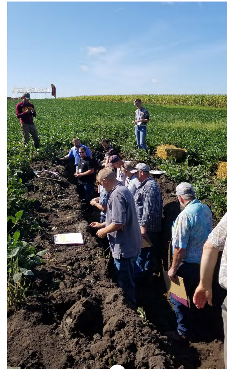
Coalition members preparing for an on-site training field trip with area farmers.